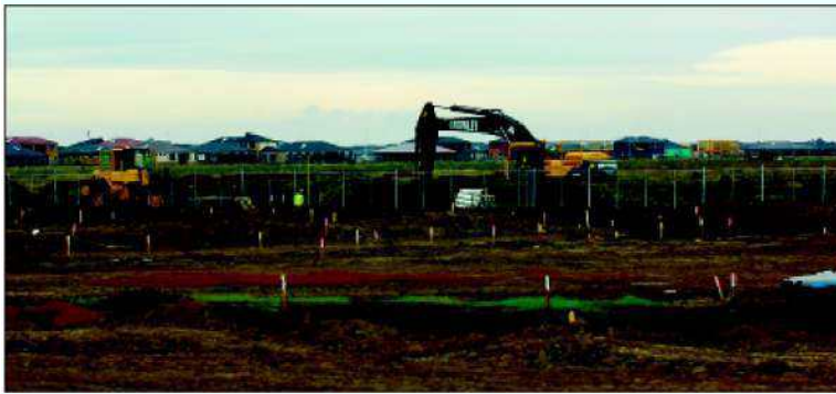
Building is to start soon on the Kingsford Display Village on Sneydes Rd.

Details: call 8353 1999 or visit kingsford.com.au