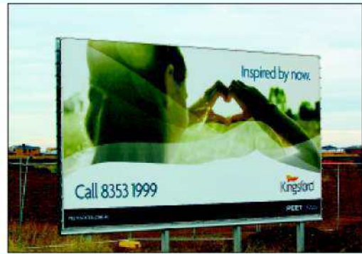
An inspiring advertisement (above) and a building (below).